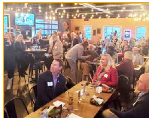
Friends of the Rotary International Foundation from throughout the district gathered at Myriad Brewing Company in Newburgh.

May the New Year bring us new joy, new direction, new clarity, and new ways of welcoming all as we put service above self to DO for our community.