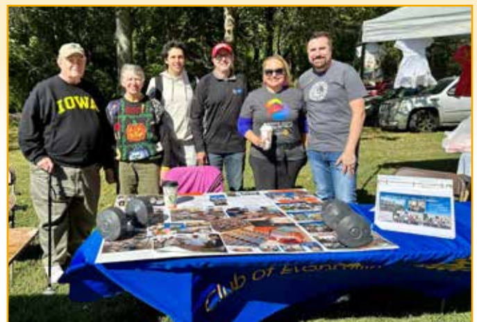
Rotary’s new DEI committee highlighted our clubs involvement with Tizimin, Mexico at the Fiesta Evansville event.