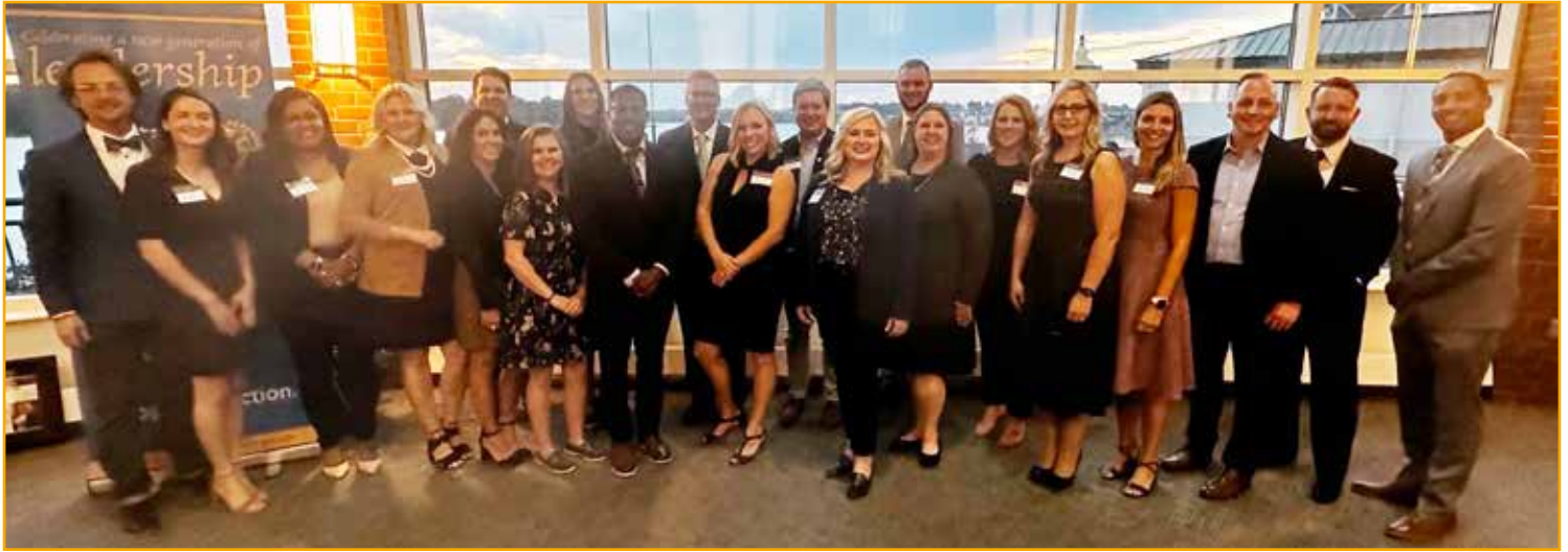
20 Under 40 Celebrates a New Generation of Leadership

The 20 Under 40 Program for 2023 was a resounding success! This annual celebration of leadership in our community saw honorees from a broad cross section of industries and services and was well received by all who attended!