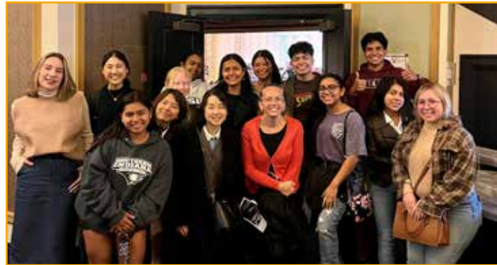
International Mentees at Evansville Philharmonic Pops Concert.