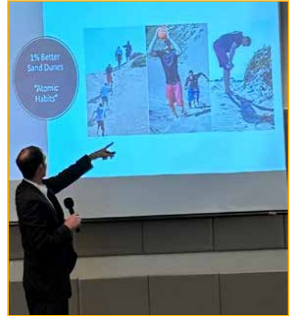
Motivational speaker Luke Zeller “Pounds the rock to get 1% better” in the NBA.

The Evansville Water and Sewer Utility’s new cascade combines function and beauty to return water to the river cleaner than when drawn.