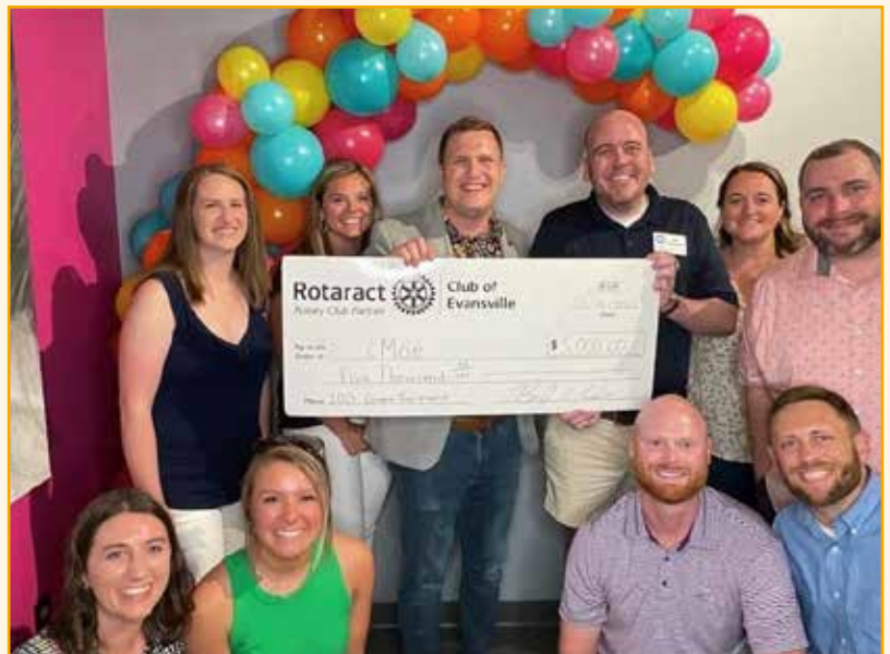
Rotaractors present Signature Project check to Children's Museum of Evansville to sponsor Family Free Nights, supporting families who may not otherwise be able to access the museum.